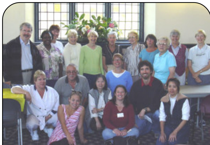
The Community Meal team of volunteers at the first lunch offered Sept.21, 2005